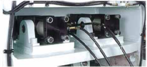
Hydraulic setting mechanism (option)

Type FS Single Toggle Crusher employs a single reciprocating toggle for compressing the feed. Since this single toggle crusher is capable of crushing lumps as large as several hundred millimeters in diameter, it is used for primary and secondary crushing. Being simple in construction, the single toggle crusher requires a comparatively small installation space and is easy of maintenance and inspection. The single toggle crushers of have a large crushing ratio and a rugged construction to assure stable crushing operation.